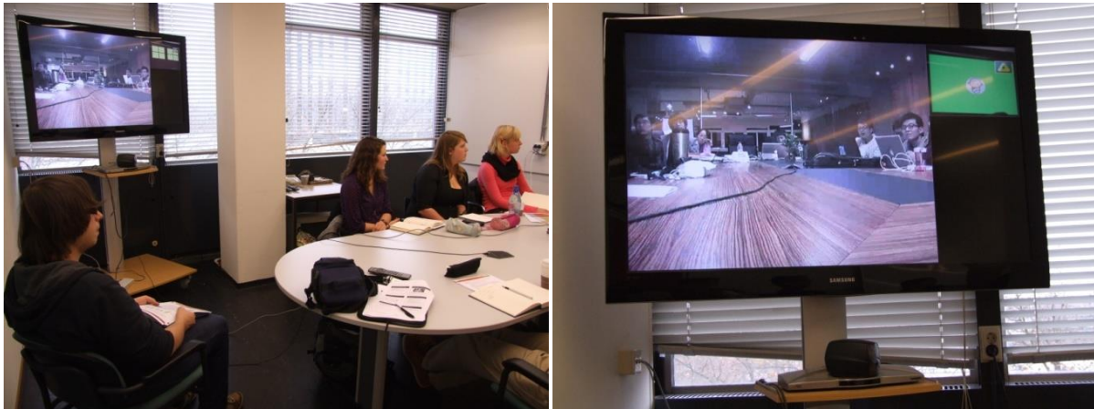
Figure 2. Design course in international teams

They make final decision and reach an agreement on design solution. In the last week, all the teams write design report and make prototype, and then present their final design. In the end, the evaluation is given, including comments from lecturer and feedback from panel.